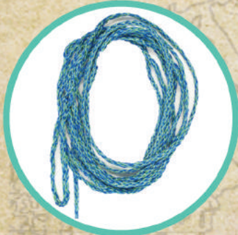
35 ft. Water Color Blended Hand Line

Extra Large Panels and legendary design make the Morada Series perform better than any other net on the market