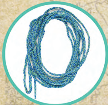
35 ft. Water Color Blended Hand Line

Morada quality backed by an industry leading warranty. If the net ever rips, tears or breaks we will replace the net for 50% of the MRSP